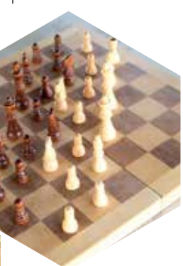
Top: Diagonal chess Left: Beach Club chill out, Unit 104 Below: Heather and Henry from Unit 108 play a game of spit.