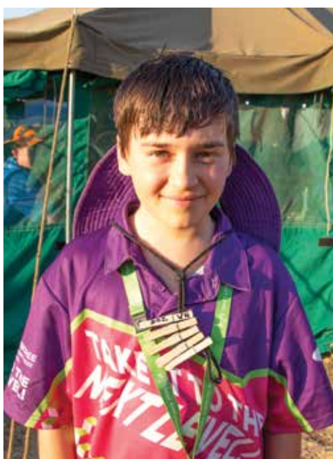
Archer returning a peg to Unit 206

It may not be quite the intended purpose of the pegs, but we think it's a great way to meet people.