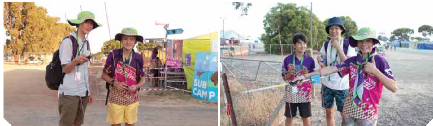
DLC - Done! Let's Celebrate! | Friday, January 7, 2022

stations in places like Japan, Finland and Germany. (Check it out at home: http://kiwisdr.com/public/ ) Scouts also race their image transmitting from Tech World using slow-scan TV, practise Morse code skills or make a Milo tin antenna.